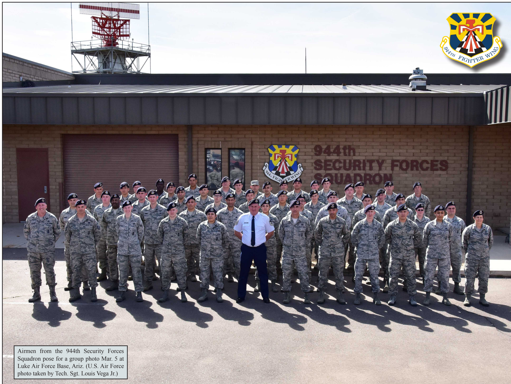
Airmen from the 944th Security Forces Squadron pose for a group photo Mar. 5 at Luke Air Force Base, Ariz.